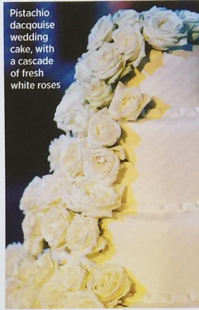
Pistachio dacquoise wedding cake with a cascade of fresh white roses

Sara says that while it can be tempting to stay in the thick of the celebrations, it's important to steal some private moments for you and your groom. "Around 4am, when the party was still in full swing, Alex and I snuck away to a secret old stone staircase that takes you to the upper balcony of the atrium. We looked at each other, we looked down to the party below, we looked up to the stunning night sky and back at each other, no words were needed – we knew nothing would ever feel more right or more magical. It had been written in the stars for us!" ■