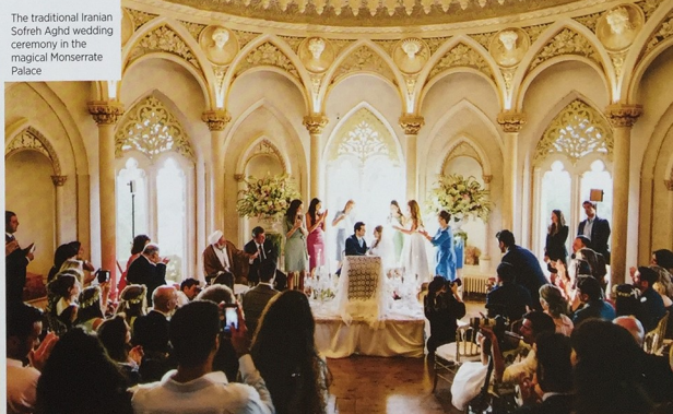
The traditional Iranian Sofreh Aghd wedding ceremony in the magical Monserrate Palace