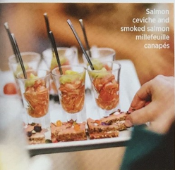
Salmon ceviche and smoked salmon millefeuille canapés