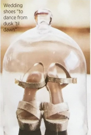
Wedding shoes 'to dance from dusk 'til dawn'