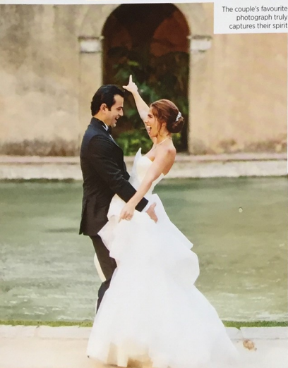
The couple's favourite photograph truly captures their spirit